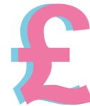
Real Living Wage