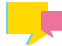
Engagement & Voice