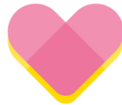
Health & Wellbeing